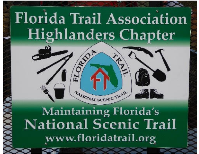
New sign on the back of the trailer.