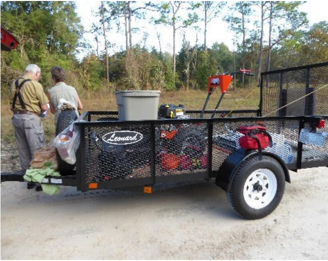
New field mower arrives in our newly acquired utility trailer.