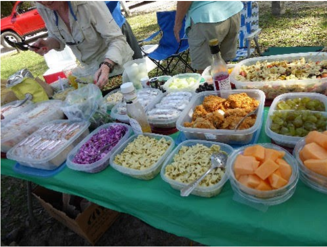
Bernice's famous lunch buffet.